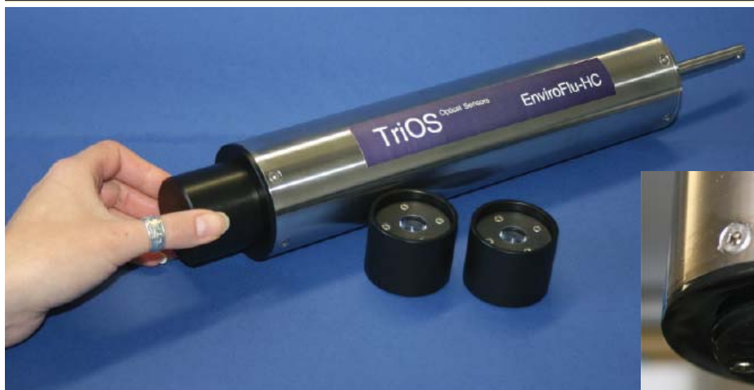
enviroFlu-HC with SolidCAL-HC solid secondary standard